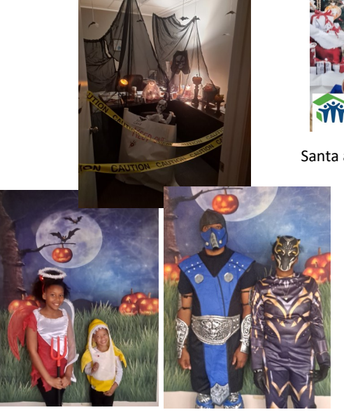
Halloween at Habitat (above)