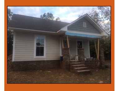
AFL Habitat Home 182 Bon Air Ave.