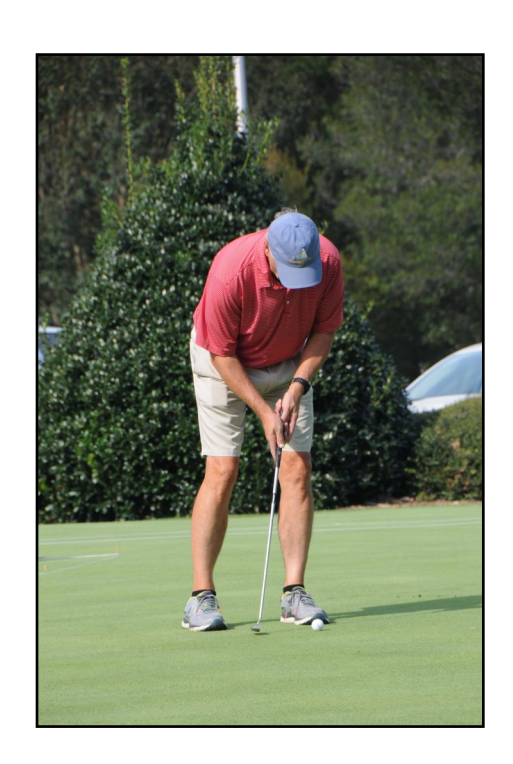
Thank you to all of the players, sponsors and volunteers who made this year the best tournament ever! We appreciate you and hope you'll consider supporting the 19th Annual Golf Tournament on Monday, Sept. 24, 2018.