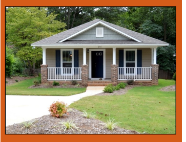
Spartanburg Interfaith Alliance Home 257 East Hampton Ave.