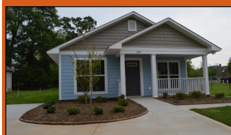
YouthBuild Home 589 Vernon St. Northside