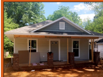
Spartanburg Interfaith Alliance Home 257 E. Hampton Ave. South Converse Street Neighborhood