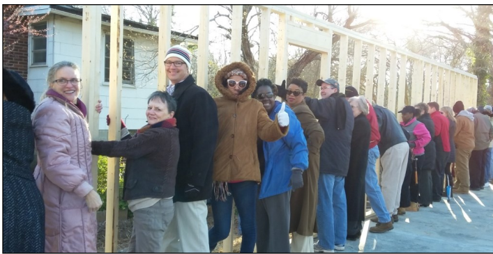
(Top and bottom left) The Spartanburg Interfaith Alliance, South Converse Neighborhood Association members, Habitat Spartanburg Board members and other community members raise the walls on the Spartanburg Interfaith Alliance Home on East Hampton Avenue.