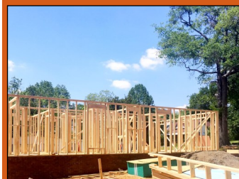
HOME Funds Home in partnership with Spartanburg County and Pacolet Milliken 549 Calvert St.