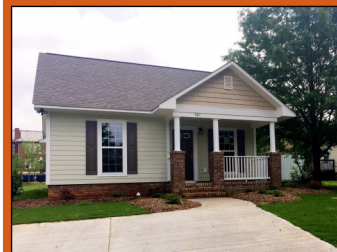
YouthBuild Home 581 Vernon St. Northside